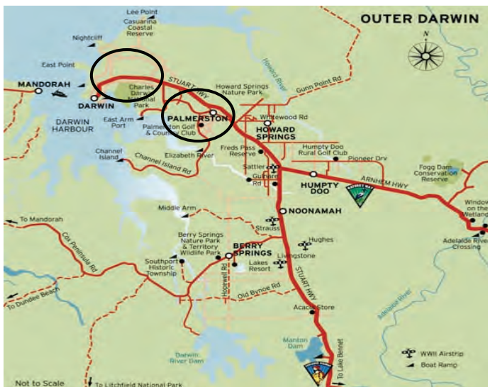
Figure 3: Map of Darwin and Palmerston - the area of the two participating urban schools

In the following section, a discussion on key findings to emerge from the data is presented. The report then concludes with an outline of opportunities for future practice and policy development as it relates to engagement and the desire for improved educational outcomes.