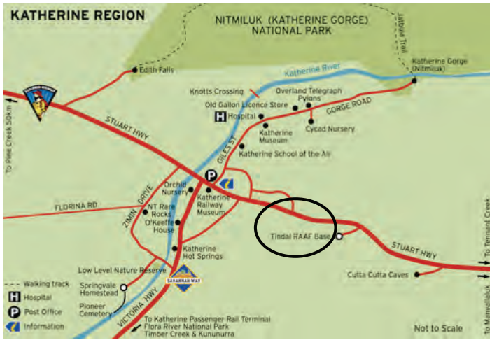
Figure 2: Map of Katherine - the participating school in a regional context

engaged in school activities. Parents do not tend to spend time in this area but use it to briefly transact with reception staff.