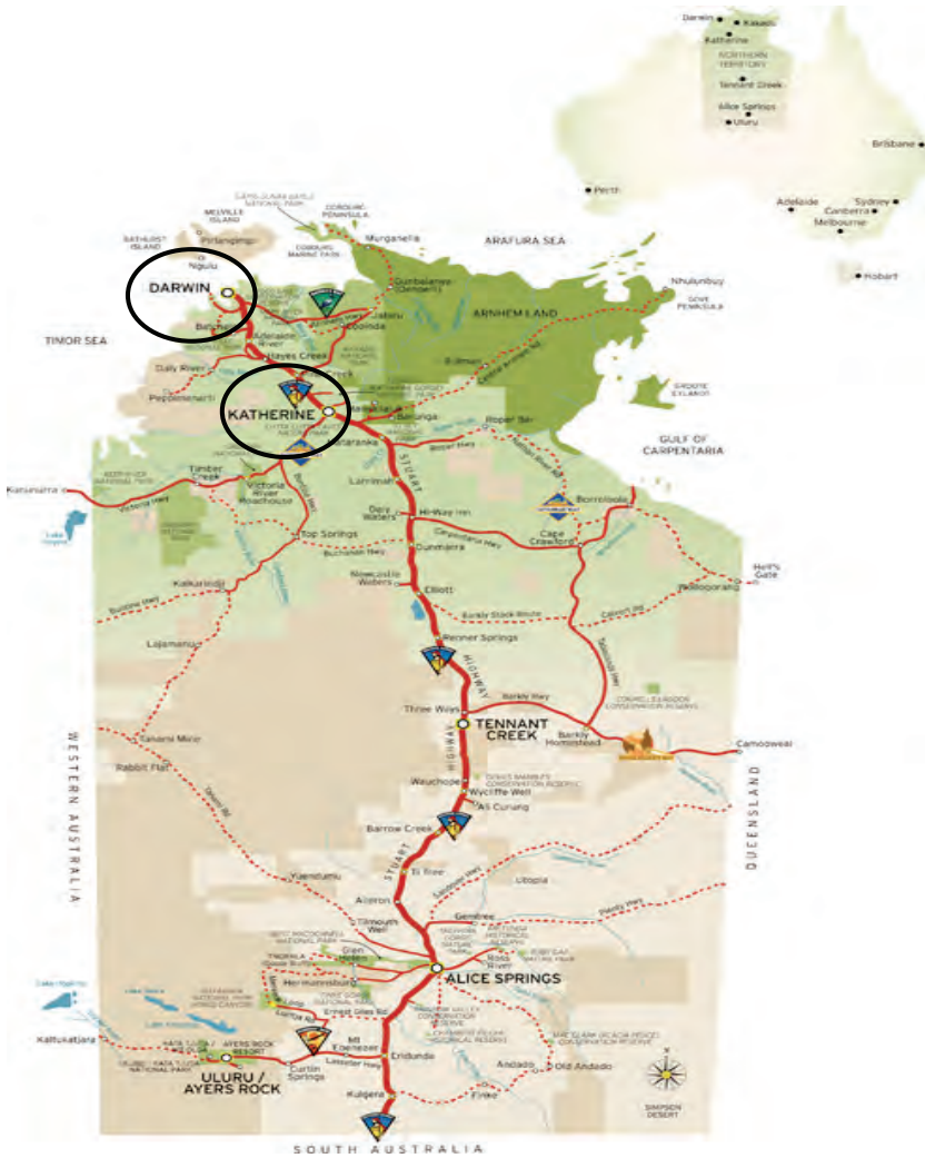
Figure 1: Map of the Northern Territory with the areas of the participating schools circled.

Of our case study sites, all are primary schools with a large proportion of Indigenous students. Two are based in Darwin, the capital of the NT, in the northern suburbs of Darwin and Palmerston, with the third based in Katherine (see Figure 1).