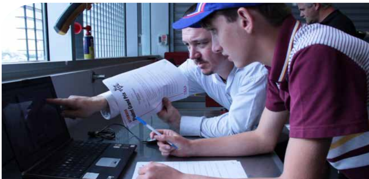
Above: Yamaha Student Grand Prix Work Inspiration Program

The partnership also offers a competition for students - the Yamaha Student Grand Prix. The Queensland Yamaha Student Grand Prix partnership creates opportunities for students in Year 9 to have a first-hand experience of the marine and motorcycle mechanics industries. Engagement at this stage of high school is seen as ensuring students get a chance to make senior subject selections and stay engaged with education. This has been developed by the partnership, modified