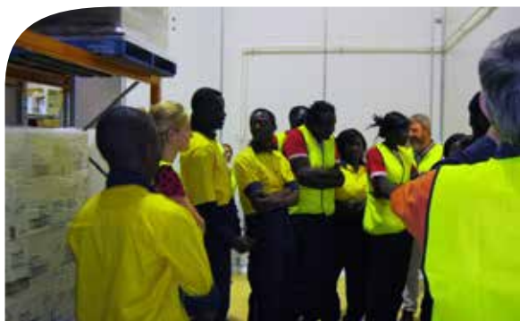
Above: CALD Summer School - Stahman visit.

There is now a collaborative cross sector reception process for refugee and newly arrived migrant children of all ages. One primary and one high school operate as lead schools and most students attend these. Primary school principals are now openly receptive to assisting parents . The two lead schools also work with other schools serving refugee and newly arrived migrant students and an English as a Second Language reference group has been established within Education Queensland.