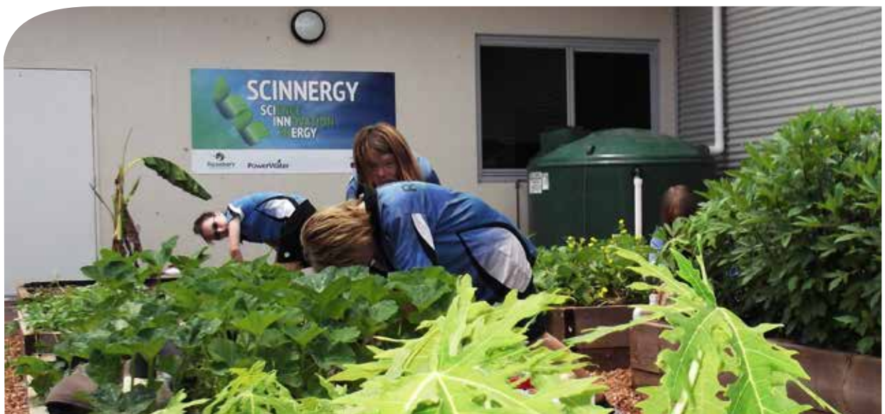
Above: Power and Water Corporation Partnership.

return home to their remote communities. Already the adjustments to the science curriculum have been shared between the schools.