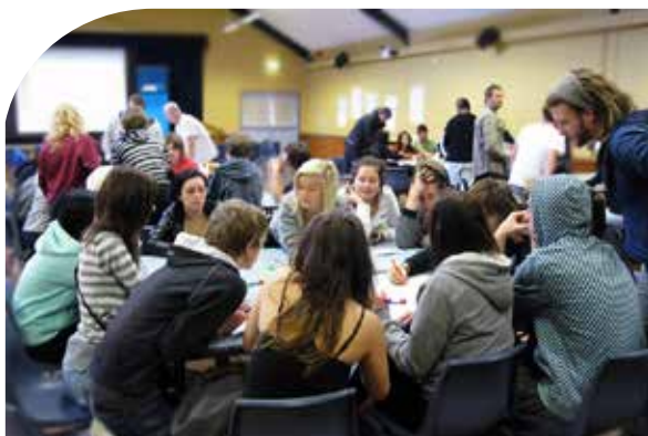
Above: ANZ Young Entrepreneurs program.