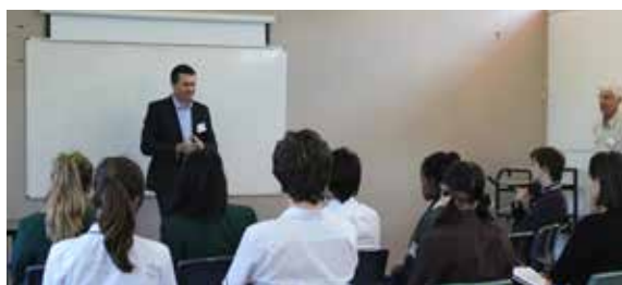
Above: Local Links Initiative first workshop, hosted by Balmoral State High School