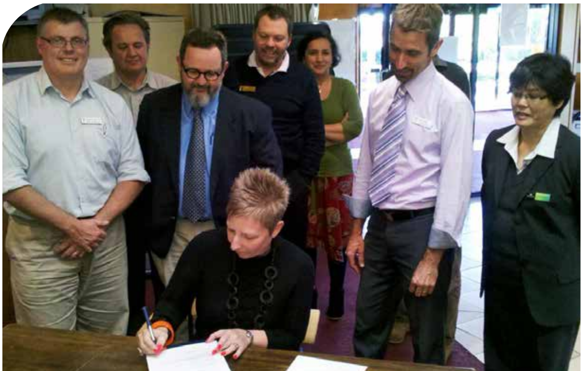
Above: A collaboration table in Toowoomba to support refugee and migrant students.

In recognition of the need to lift Australia's Year 12 or equivalent completion rates, the Council of Australian Governments (COAG) agreed to a National Partnership on Youth Attainment and Transitions in July 2009. The Partnership seeks to improve young Australians' educational outcomes and transition to