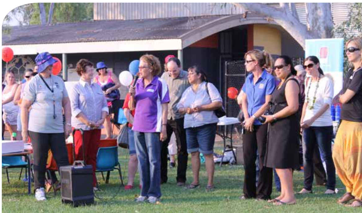
Above: PEGS partnership launch.

The Smith Family Partnership Brokers helped establish the Partners Engaging Gray School (PEGS) partnership which brings together the school and eight partners, including the School Council. Partners meet regularly to work through issues at the school, share information, plan joint programs and ensure services work together effectively. There is a formal Co-operation Agreement and an agreed action plan. Partners have a better understanding of the services each provides and for some families there are holistic family care plans which involve a number of partners working together. Other benefits of the approach according to one partner are to de-stigmatise the need to seek help if the services are part of the school and working well together.