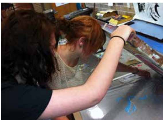
Above: ANZ Young Entrepreneurs program.