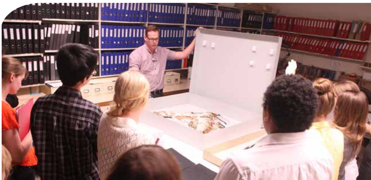
Above: Queensland Museum Work Inspiration Program

Students also worked in small groups to develop their ideas for new museum experiences, which was a good opportunity to develop friendships with peers from different schools. They presented their ideas to senior managers at the end of the three days, explaining their idea, who it was targeted to and why the Museum should do it. It was their opportunity to contribute to something at the heart of the organisation and it was the Museum's chance to hear directly from young people about what would appeal to them.