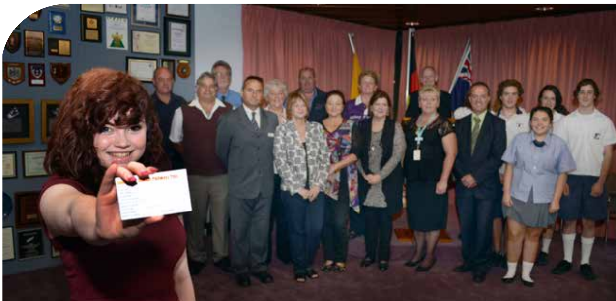
Above: Shoalhaven Student Pathways Pass Launch.

There were no contractual obligations from Transport NSW on any bus company to agree to the Shoalhaven Student Pathways Pass. It took attendance at a number of meetings of the relevant decision-making body - the Shoalhaven Transport Group - over approximately 18 months, to persuade the bus companies and Transport for NSW to agree to a solution. Central to this was developing a proposal which made use of services which were mostly under-utilised and was therefore cost neutral. Strategies included conducting a survey of 32 local educational and youth organisations to document the transport problems affecting young people (this evidence gave the partnership the initial invitation to the Shoalhaven Transport Group), and arranging for a Year 11 work placement student to present to a meeting of the bus companies. Her presentation made the problem real as she graphically