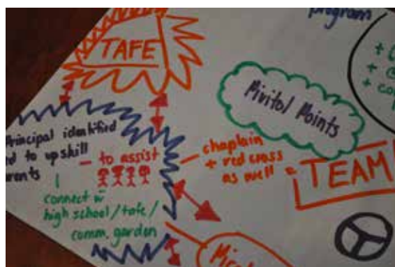
Above: Partnership Broker's notes.

One partnership aiming to involve a major company required meetings with the National Human Resources Manager in Sydney, the Human Resources Manager in Queensland and the head of their training arm in Brisbane, before they could meet and work with the individual local managers of the three retail outlets which would be directly involved in the pilot. Within an individual school, Partnership Brokers will often meet and establish relationships with the principal, the head of the senior school, the Vocational Education and Training (VET) Coordinator, the Careers/Guidance Officer and multiple individual teachers.