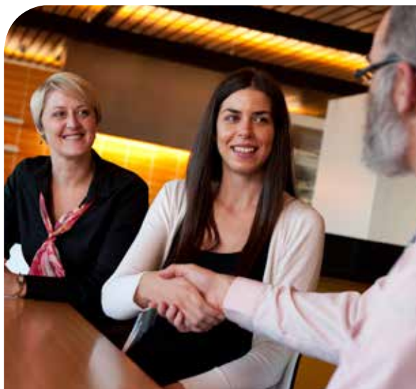
Above: Partnership Brokers.

The Educating Remote Area Indigenous Children in an Urban Setting (ERICUS) program was developed and largely driven by the school itself from 2008-09 but in October 2010 they sought assistance from The