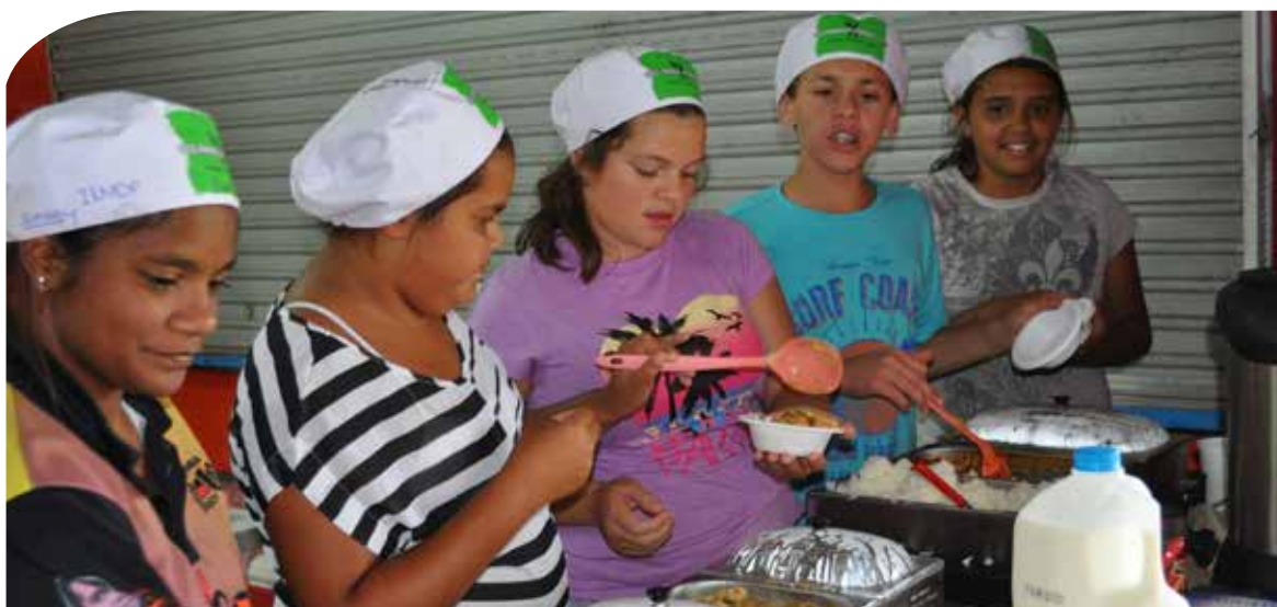
Above: Diabetes Queensland Need for Feed program at the Jack Martin Centre.

Finally in early February 2013, the new joined-up Committee signed a 10 year lease with the Administrator. As an Indigenous elder reflected, I said I'd never get involved again, never come back, but I have gotten involved as I've seen this is a worthwhile project. Since then more than 60 Aboriginal and Torres Strait