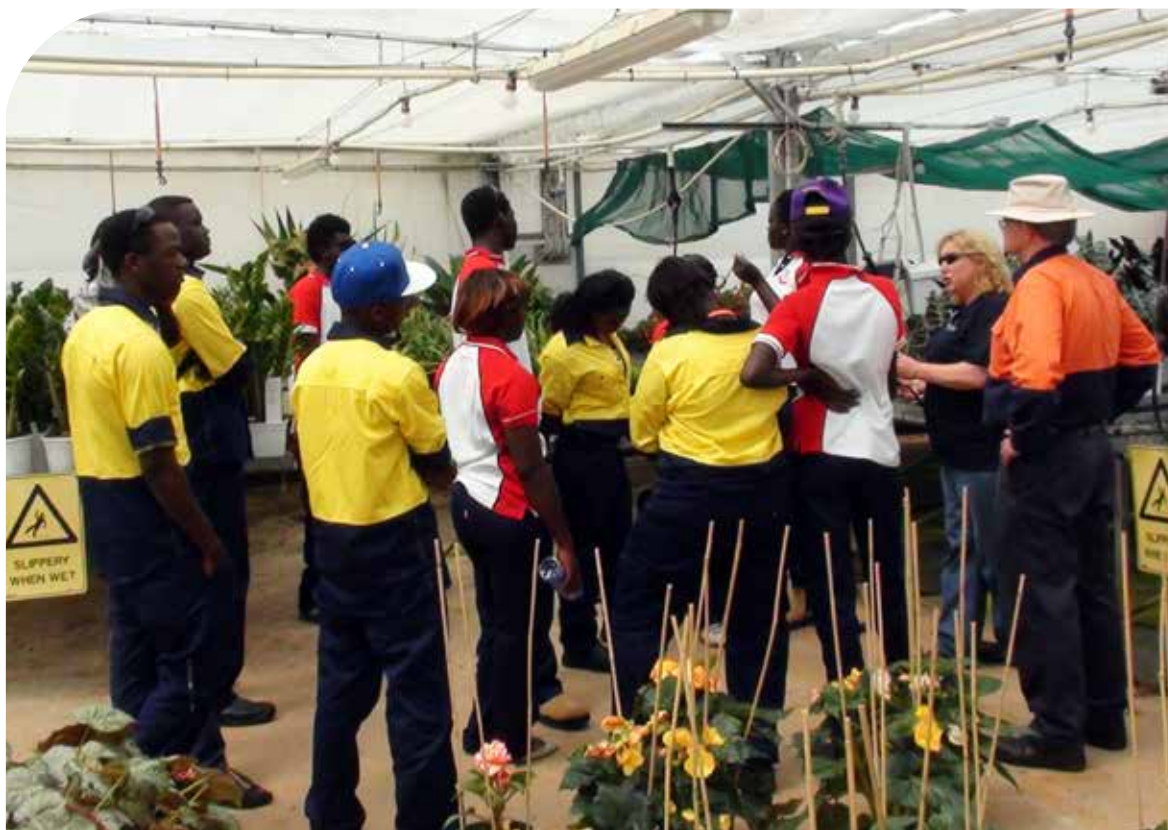
Above: Summer school for refugee and migrant students in Toowoomba