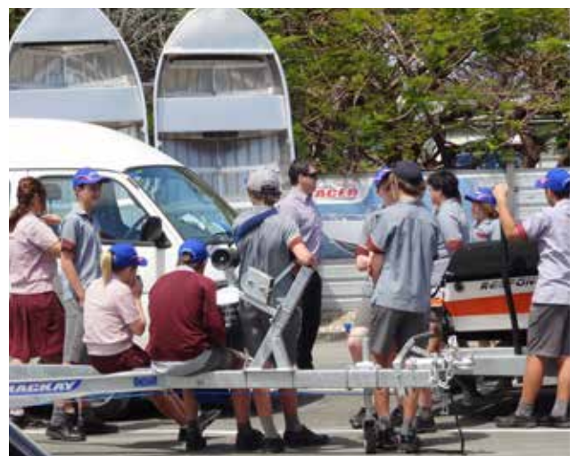
Above: Yamaha Student Grand Prix Work Inspiration Program