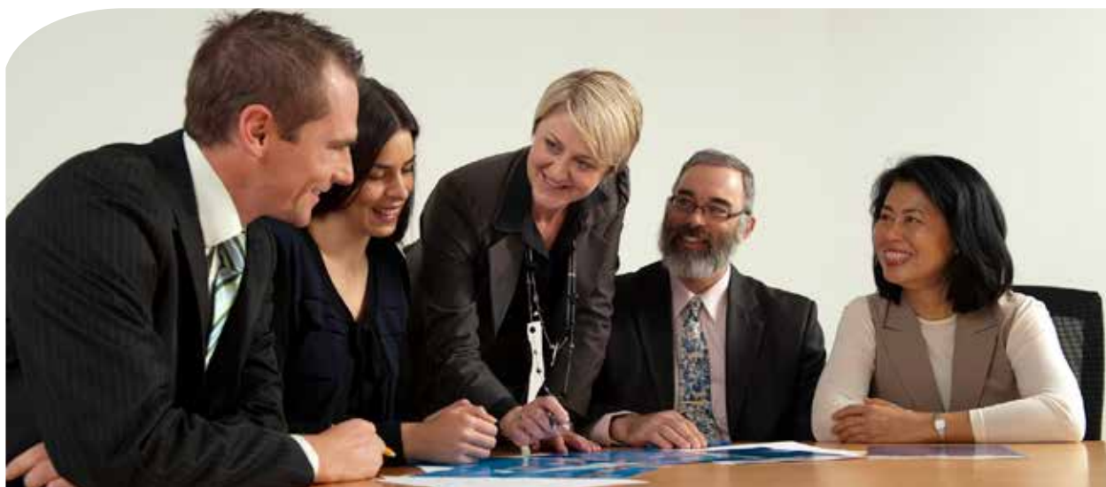
Above: Partnership Brokers.