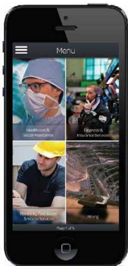
Above: The Career Hunter App.

Following its initial success, it was clear a better option was needed to distribute it more widely and keep it up to date. The solution - a mobile App - emerged following partners' attendance at the Click Digital Expo, hosted by RDA. The Career Hunter App transforms the resource into a much more interactive learning tool with the opportunity to enable data to be automatically updated and linked to current apprenticeship and traineeship opportunities and live job ads.