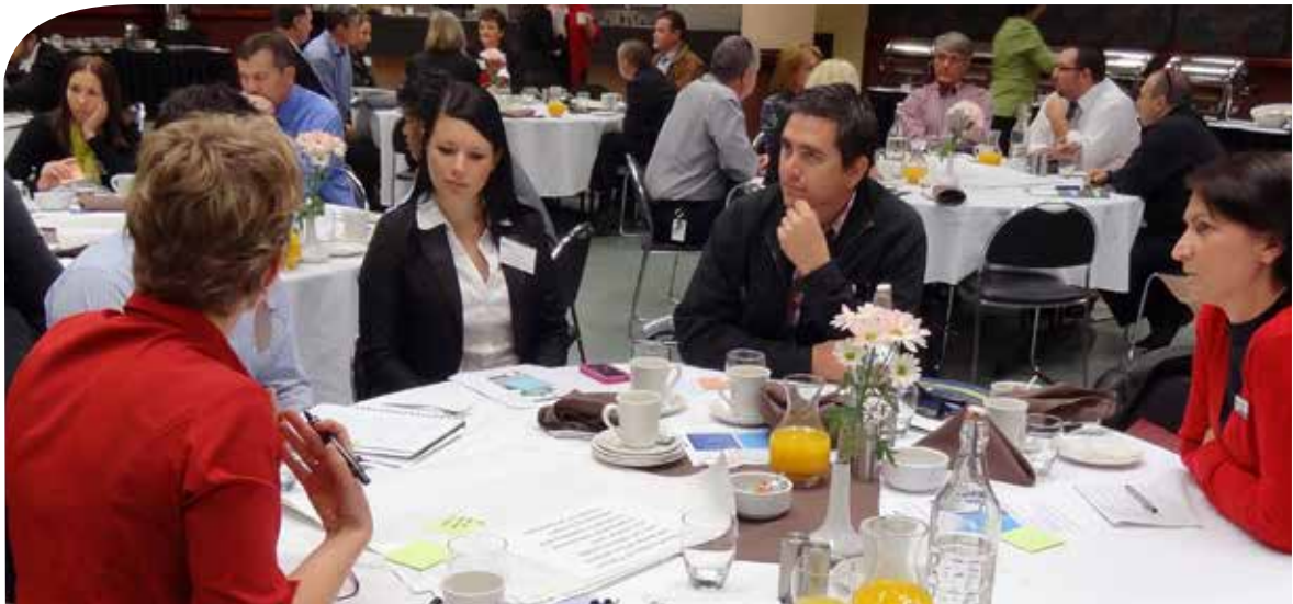
Above: Partnership Brokers facilitating a workshop

He consulted with a large number of diverse potential users to identify the problem and involved them in testing and validating the tool to ensure it could meet their needs.