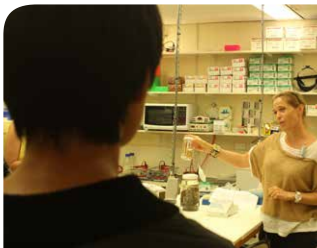
Above: Queensland Museum Work Inspiration Program

The Partnership Broker saw it was a good fit for a Work Inspiration pilot and suggested the Museum offer a learning experience for students at the same time as obtaining their ideas about how to encourage more young people to come to the Museum. The key for Work Inspiration and many other youth attainment and