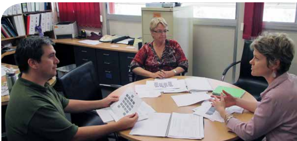
Above: Partnership Brokers with the Principle and Head of Industrial Arts at Sandgate District State High School planning for the Partnership Action Committee