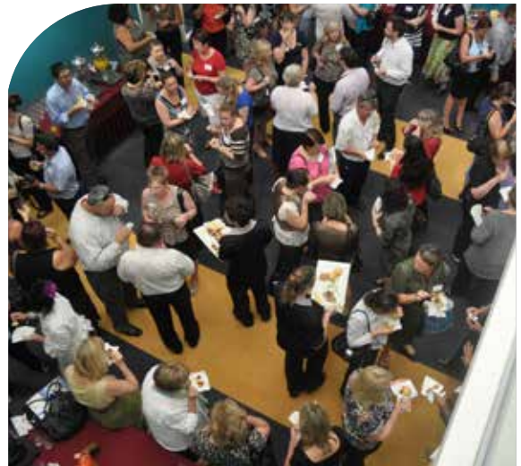
Above: Partnership Brokers' event