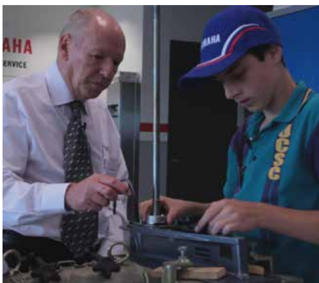
Above: Yamaha Student Grand Prix Work Inspiration Program